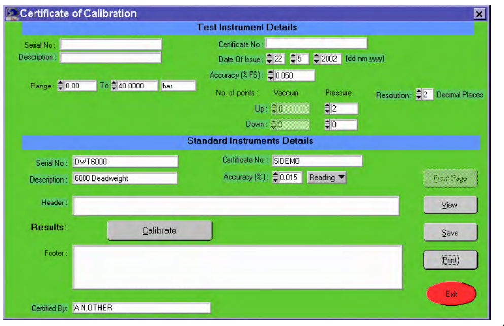
Figure 6-2. Certificate of Calibration Window

Front Page window is only shown if it has been tagged to the certificate. See Tagging a Front Page to the Front of a Certificate.