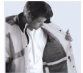
Thermal insulation with side-snapped opening.