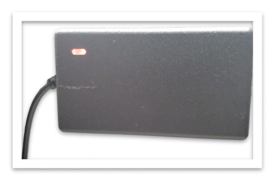
RED = Battery is charging

NOTE: If the light is flickering between Blue and Red, this may occur when a battery pack is charged to 100% while a device is connected.