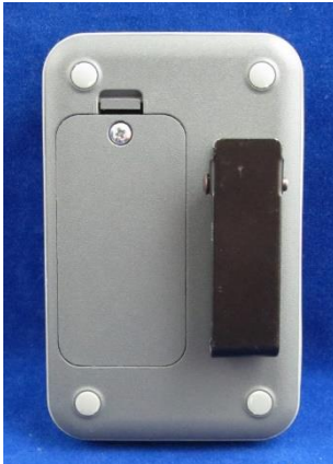
Dimensions – 4.25" L x 2.68" W x .91" D (note: belt clip adds .43" to depth)